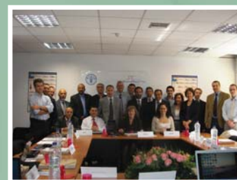
Inception Meeting of the EastMed Project

1st Coordination Committee of the EastMed Project (Athens, Greece 19-20 April 2010)