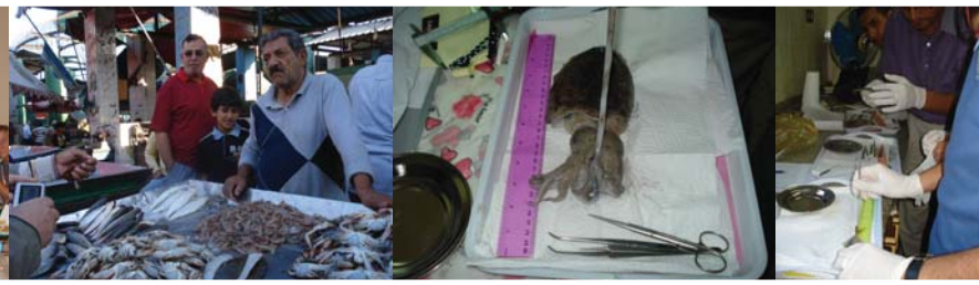
Fish vendor in Egypt