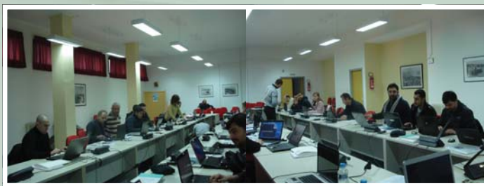
Participants undertaking some exercises during the stock assessment training course

1st mission of the pilot survey on fisheries dependent data collection (Egypt, 7-26 Nov 2010)