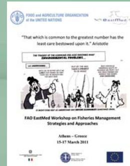
Workshop on Fisheries Management; Meeting Folder - The Tragedy of the Commons.

1st Coordination Committee of the EastMed Project (Athens, Greece 19-20 April 2010)