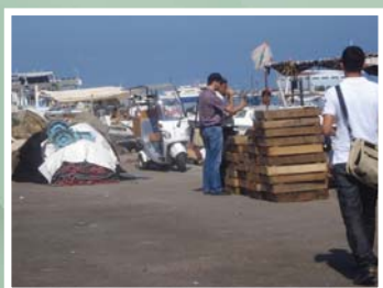
Field data collectors at work in Lebanon

Sub-regional Workshop on Collection and Organization of Data (Batroun, Lebanon, 14-17 sep 2010)