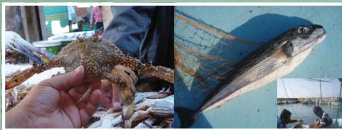
Portunus segnis a commercially important lessepsian species Lagocephalus scleratus a lessepsian species responsible for damaging nets

Sub-regional Workshop on Collection and Organization of Data (Batroun, Lebanon, 14-17 sep 2010)