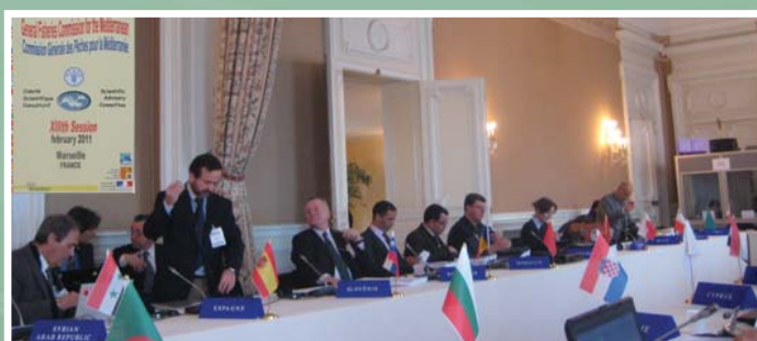
Experts participating at the 13th Session General Fisheries Commission (GFCM) Scientific Advisory Committee (SAC) Marseille 2011

Sub-regional Technical Meeting on the Lessepsian migration and its impact on Eastern Mediterranean fishery (Nicosia, Cyprus, 7-10 Dec 2010)