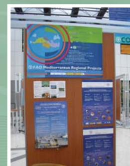
Stand of the Mediterranean projects at the FAO 29th Session of the Committee on Fisheries (COFI) Rome 2011

Workshop on Fisheries Management Strategies and Approaches