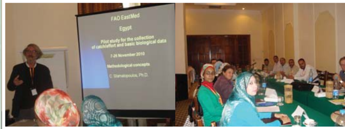
FAO Fisheries consultants delivering a lecture in Egypt

Ad-hoc on the field training course on otolith/spines sectioning and age reading (Athens, Greece, 19-20 April 2010)